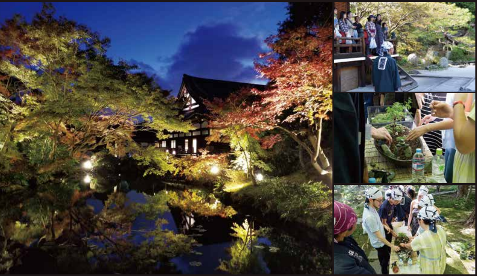
UEYAKATO LANDSCAPE Co., LTD